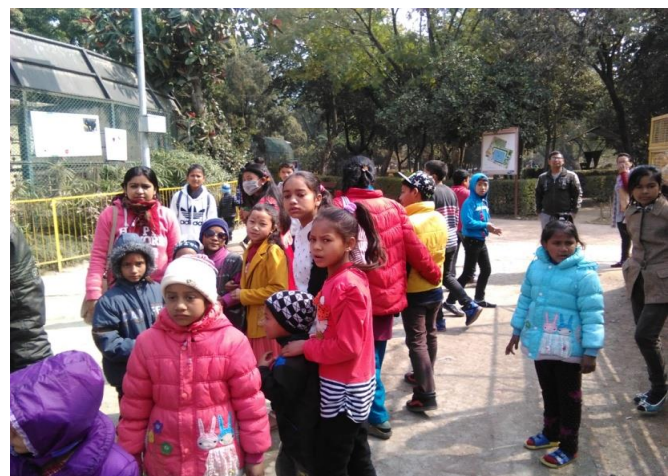
Children getting enterataining watching different animals and birds in Zoo