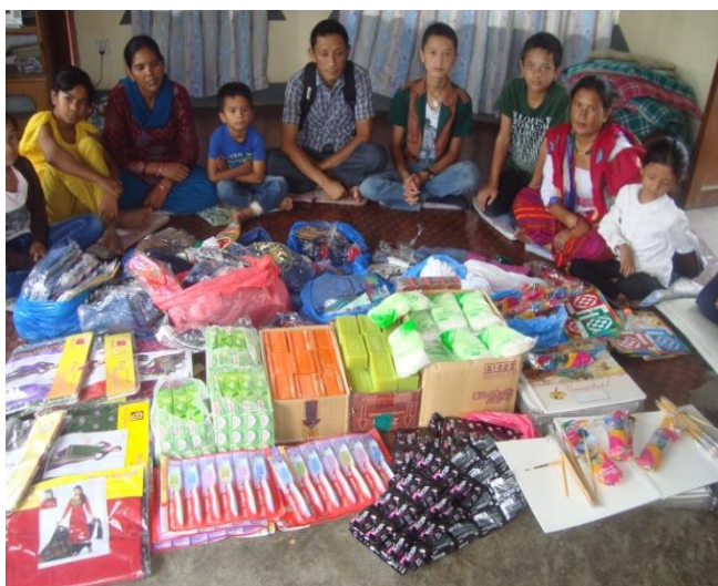
Relief material distribution to Kids in Kathmandu

On April 25, 2015, A powerful earthquake measuring 7.9 Richter has caused devastation in many areas of Nepal mostly affecting central region which includes capital city Kathmandu and historical places like Bhaktapur, Lalitpur, Gorkha ,Sindhupalchok, Nuwakot. The devastation is unimaginable and many people have lost everything. More than 8000 persons have died injuries after being buried under the collapsed structure. Displacement in urban and rural areas has an immense impact on daily life. Afraid of returning to their homes, many people have stayed in makeshift tents along road sides or in friends and neighbors' gardens in Kathmandu. The devastation is unimaginable and many people have lost everything; lives have been lost, homes have collapsed, food or equipment to prepare food is limited, and livestock has been killed. Realizing such critical condition, Shakti Milan Samaj had provided with different material for the earthquake affected children and family living with HIV/AIDS. In this program activities, those children and family are prioritized who are mostly affected by divesting earthquake.