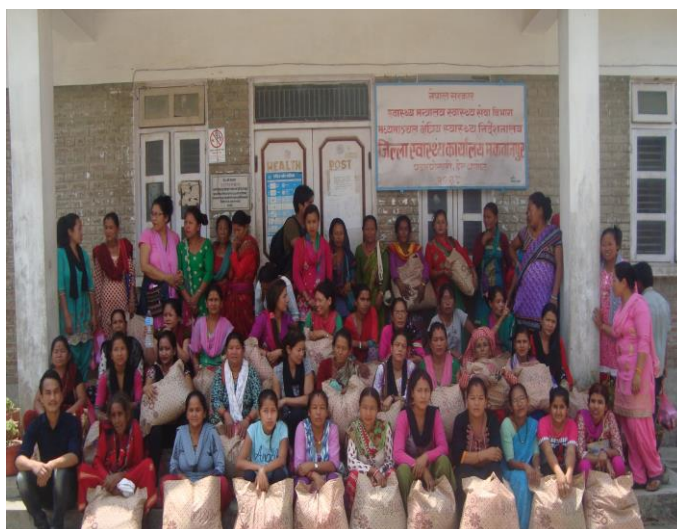
Relief Materials Distribution in Makawanpur