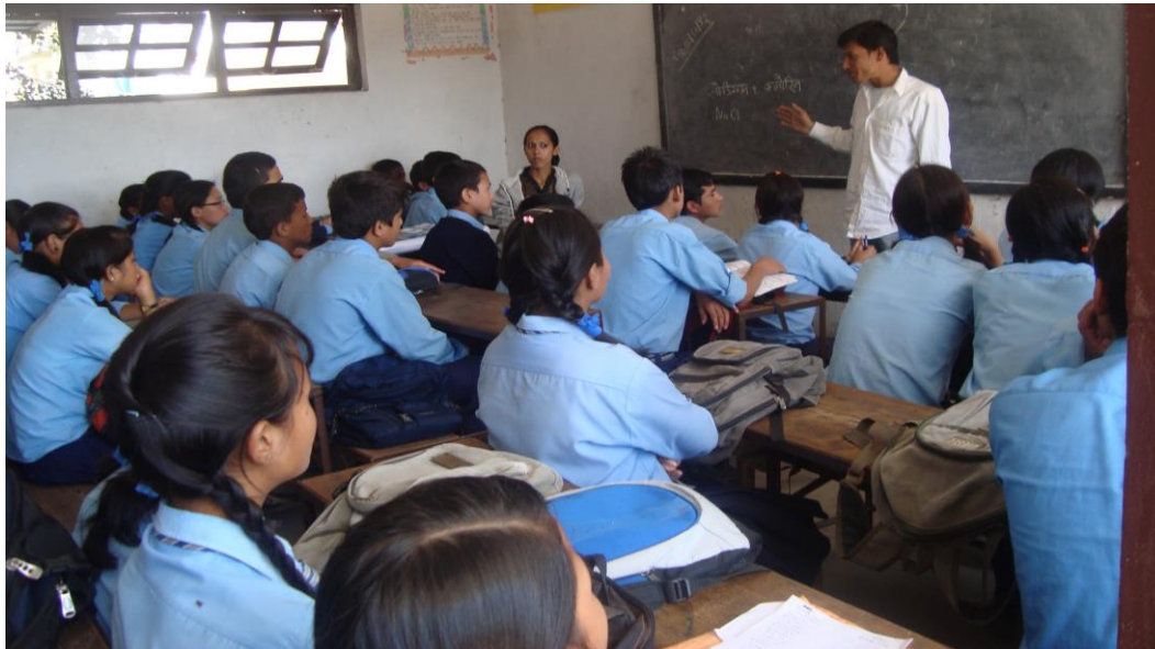
School Orientation Program