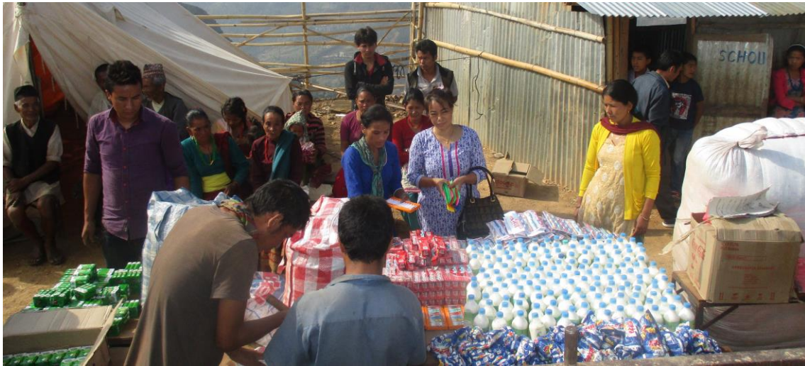
Relief Material Distribution in Ramechhap District